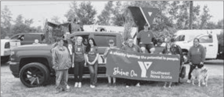
The South Shore YMCA.