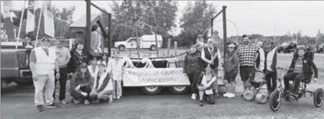
The Region of Queens Municipality put together an amazing float.