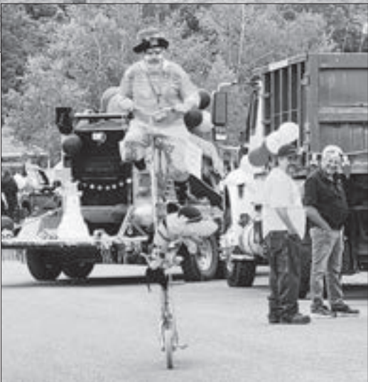
The Mersey Foods float finished second in voting.