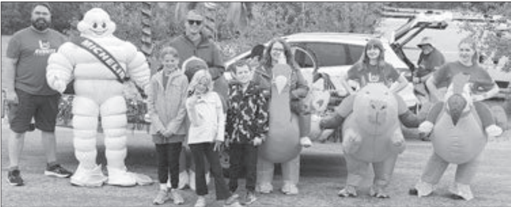
The Michelin entry.