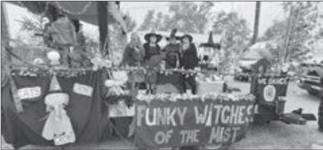
The Funky Witches of the Mist won the best float of the Privateer Days parade held June 28.