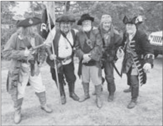
The Pirates of Halifax are always a lot of fun.